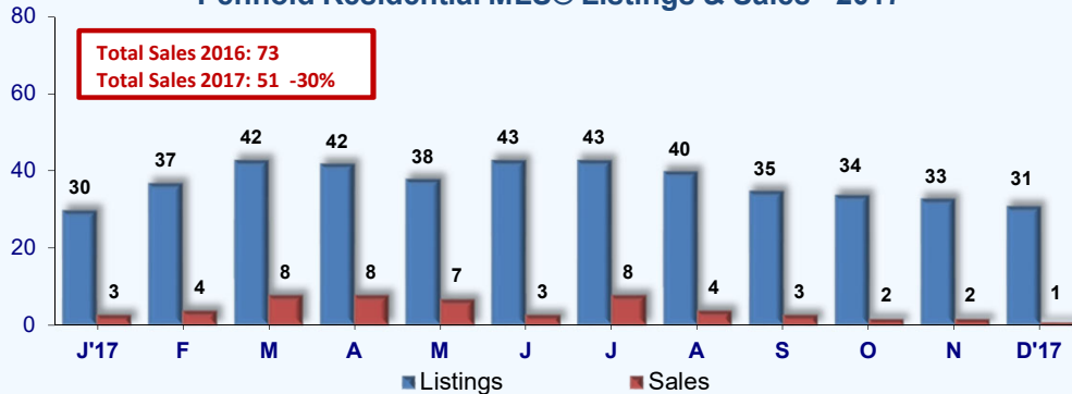
Penhold Residential MLS® Listings & Sales - 2017

The blue bars represent the total number of active listings in this market at the beginning of the month.