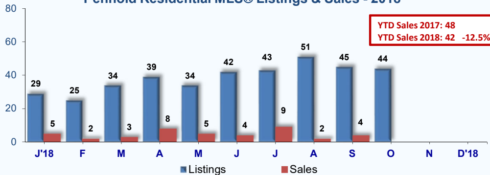
Penhold Residential MLS® Listings & Sales - 2018

Consumer confidence is one of the most important ingredients in a healthy real estate market and it's been mostly missing since oil prices collapsed in January 2015. There has been some good news in the last year... oil prices back up to +$70US along with government assurances that the economy is on the mend, but every piece of good news has been negated by ongoing delays in pipeline development (that would reduce the discount on the price of Alberta oil) and the federal government's inability to finalize a new North American Trade Agreement.