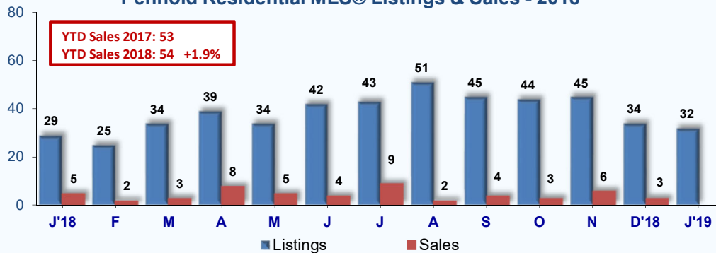
Penhold Residential MLS® Listings & Sales - 2018

It's human nature to want to start the new year off full of hope and optimism and we believe 2019 certainly has the potential to be better than 2018 in many ways. Alberta's economy has been struggling since January 2015 when oil prices crashed, finally recovered, and then crashed again because of the crippling price differential we experienced this past year.