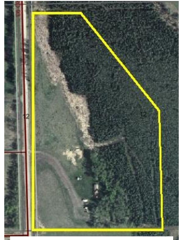
Yellow line - approximate property line

Call 780-388-3759 for Tender BID Package or to schedule appointment to view