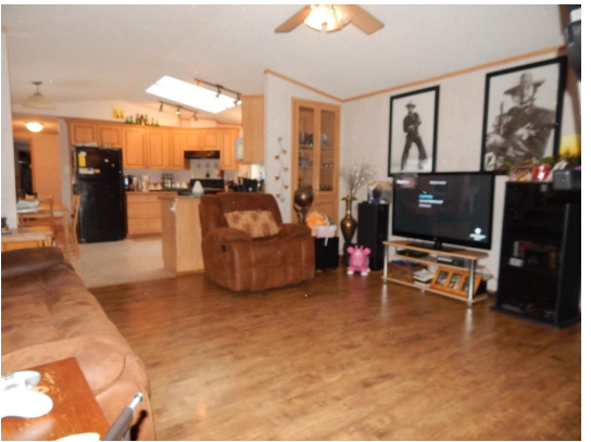
Living room - vaulted ceiling, laminate flooring