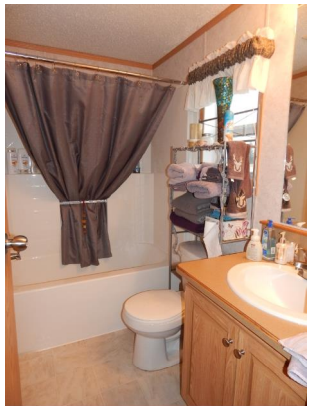
Main 4 pce bath