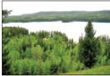
CRYSTAL LAKE VIEW

10 acre of pristine and private wilderness in the sought after Interlakes area of the South Cariboo, with a bonus of southern exposure and a fabulous view of beautiful Crystal Lake with untouched Crown land bordering the southern shoreline of the lake. Easy access mins from Hwy 24 on year round, maintained N. Bonaparte Rd. Property offers much more than just an incredible view from a choice of building sites, it also backs onto Crown land. Undeveloped public access lake is across the road, with a roughed-in trail to the top of the property accessing miles of trails for snowmobiling, quading, dirt-biking, hiking etc.