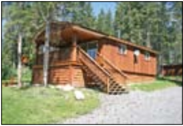
COTTAGE WITH CABIN

Beautifully finished, newer 2 bedroom cottage overlooking Timothy Lake. This perfect recreational property has a heated and wired shop, a cute (non-conforming) guest cabin, a carport and a wood shed. The yard is also completely fenced to keep the pets and kids in. Timothy Mountain ski hill is just a short ways away for winter activity and Timothy Lake is right across the road for summer activities. Beautifully furnished and most furnishings are negotiable. Lac la Hache. Shelley Kotowick $249,500 MLS# N208974