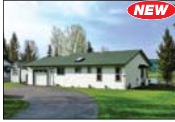
RANCHER W/ MILLION DOLLAR LAKE VIEWS!

2,600sf cordwood octagonal home located near Otter Lake, just north east of Bridge Lake. Three floors in all. This home has 3 bdrms, updated kitchen, bathroom (needs some finishing) and new flooring on most of the main floor. The third floor is framed and dry walled ready for you to finish. Newer airtight wood stove and rock work base in open concept livingroom. This property is fenced and cross-fenced so an ideal property and location for your horses. Bridge Lake. Robert Young $245,000 MLS# N205883