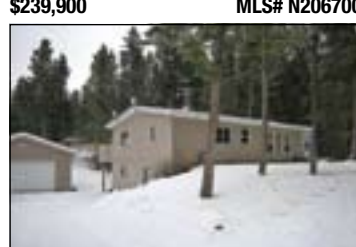
SPACIOUS HOME ON LARGE PRIVATE LOT

Looking to downsize? Check out this sparkling clean and bright, 2 bedroom 2 bathroom rancher with a million dollar view overlooking Horse Lake. Immaculate inside/outside. Nicely landscaped! Crown land and lake access nearby. Quiet cul-de-sac in great neighbourhood and so close to town. Superb water! Enjoy the unobstructed view from the hot tub/deck. Horse Lake. Martin Scherrer $239,900 MLS# N215356