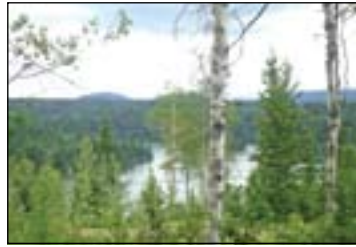
ACREAGE WITH VIEW OF LAKE

Nicely treed 11.9 acres property with view on Bridge Lake and distant mountains. Driveway into cleared building site and to small hunting and fishing cabin. There is also a storage shed situated close to the cabin. Great location close to Bridge Lake public access and Hwy 24. Borders Crown land. Enjoy holidays here or build your dream home..