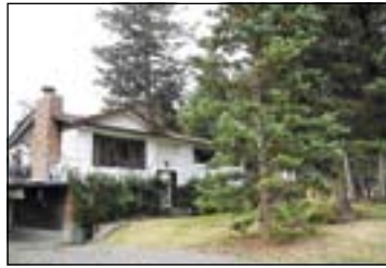
ACROSS THE ROAD FROM LAKE

Walk to work, school or shopping. 2 bdrm, 2 bathroom bungalow with a full bsmt to further expand if needed. This well cared for home has had recent updates to roof, windows, flooring, furnace and hotwater. Spacious with lots of light and storage room. Large sundeck overlooks the private fenced yard and garden area. Complete with a double carport and storage shed. A pleasure to show. 100 Mile House. Debbie Popadinac $248,000 MLS# N215193