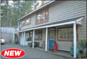
5 MIN. TO HORSE LAKE LAUNCH AND RECREATIONAL TRAILS

Lovely remodeled home with large bright kitchen and living room. Lots of windows and oak kitchen cabinets. Double doors from kitchen to two-sided deck. Huge yard with storage shed. Basement entry from single attached carport. Two bedrooms on the main floor and one in the basement. Bathroom in bsmt also has laundry. Utility room has shop area. Wood heater in recreation room. A very nice, well kept home suitable for retirement or family with children. Home sits high on the property and has a nice view of country side. Close to school and all 108 Mile amenities. Easy to show. 108 Mile Ranch. Donna Morrison $239,000 MLS# N213145