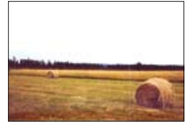
200 ACRES - HAY FIELDS

200 acres mostly hay fields which can be flood irrigated. Located just past Binnie Road (at Rail Lake) on Spout Lake Rd. Property has been hayed in the past 2 years by the present owner. Property is flooded in the spring and dries out in the fall. About 90% is in the ALR. Sign on property.