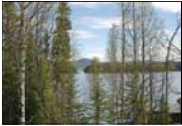
5 ACRES BRIDGE LAKE VIEW

Almost 5 acres of elevated land with great views of Bridge lake. Located just a few steps away from a boat access near the end of a no thru road. Well treed property with driveway in. Several good building sites and power at the road. Great location for your cottage or your retirement home. Enjoy all the benefits of waterfront living without the waterfront taxes.