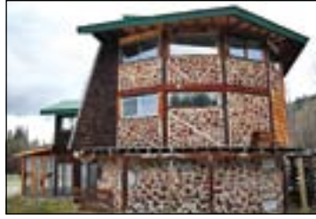
11.9 AC - WALK TO LAKE

Many upgrades to this Horse Lake view 4 bdrm/2 bathroom family home. Large attached shop w/220 panel, re-designed kitchen/eating area, new tile and laminate flooring, freshly painted and updated bathroom fixtures. Quality and character throughout with bright spacious sunroom, covered back patio, 9-hole mini golf in the backyard, yard large enough for private ice rink. Ideally located for elementary school and buses, home based business, boat access, 5 mins down the road, multi-purpose recreational close to by. 15 mins to 100 Mile House for shopping and services. Horse Lake is a great swimming, boating, fishing and water sports lake. Horse Lake. Darrel Warman $249,000 MLS# N215812