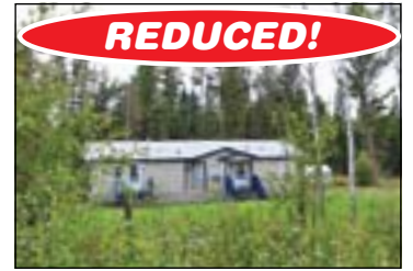
JUST 5 YEARS OLD!

Quiet cul-de-sac location, this 4 bdrm, 2 bathroom home is located at desirable 108 Mile Ranch. 1994 modular moved to concrete foundation with finished bsmt in 2002 and makes for a spacious open floor plan family home. Kitchen has large island with extensive cabinets and pantry. Vaulted ceilings, skylight and numerous character windows provide for a bright main floor living area. Detached double garage in 2011 w/200 amp service, backing on to pipeline trails for hiking, biking and snowmobiling. Large 0.9 acres lot, mainly treed for privacy with recently built large upper deck. Very large family/recreational room in the bsmt has cozy wood airtight for all the comforts of a family home. Quick possession possible. Call today. 108 Mile Ranch. Darrel Warman $239,000 MLS# N214858