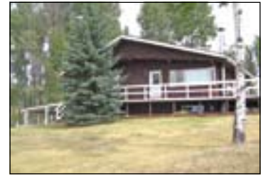
REMODELED HOME WITH VIEWS

Move right in to this well maintained home at the 108. Traditional bi-level entry with 3 bedrooms up and family room down. Located on a quiet street in an area of nice homes. The deck and water softener were replaced in '07. The shop is 24x24 and there is a small cabin, shed and greenhouse. Appliances included. The 108 offers recreation all year round including golf, hiking and access to snowmobile and x-country trails. The 108 Lake is close by as well. 108 Mile Ranch. Diane Cober $239,900 MLS# N206700