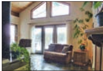
PRIVATE OTTER LAKE WATERFRONT

1st time on the market. High quality custom built waterfront home sitting on a heavily treed 5.78 acres in the Bridge Lake area. Brand new "lifetime" roof & gutters installed in 2013. Features include high-end slate & tile flooring, expansive decking, attached garage, c/w 2 – 10ft wide, 12ft high doors, 3 bay detached lean-to-carport & much more. Located on no-thru road for plenty of privacy & access to 100's of miles of trails to outlying fishing lakes & Cariboo vistas.