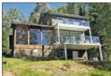
PRIVATE LOCATION ON MUCH SOUGHT AFTER LAC DES ROCHES

Much sought after waterfront home on over an acre for privacy. This totally rebuilt home features a showpiece kitchen, cathedral ceiling in living room with extensive glass looking southwest over beautiful Lac des Roches, 4 bedrooms, 3 bathrooms, gentle slope to shore. Decks off living room, kitchen and a balcony off the upstairs master bedroom and much more. The full walk-out basement is ideal for finishing into a workshop & games room or bring your plan. Many extras are included in this home. Located on a quiet no thru road. What a view! Book a viewing today. Lac Des Roches. Robert Young