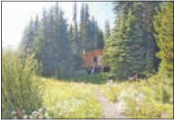
IDEAL FAMILY GET-AWAY CABIN

Deka Lake. Louise Cleverley $89,000 MLS# N224214