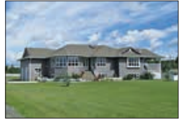
EXECUTIVE HOME W/VIEW OF GREEN LAKE

Custom built executive home on over 1 acre w/ a view of Green Lake. Over 3500 sq ft of top notch finishing throughout. 5 bdrms, 3 bath home was previously run as "Eagles Nest B&B". 3 bdrm, 2 bath on main w/ 2 bdrms & bath down complete with kitchen. 3 gas fireplaces & lots of windows making it feel bright & spacious. All set up with generator for both house & shop. Attached oversized garage & a separate 26x36 2 bay shop w/ a tall door. Both shop & garage are heated. Situated in an area of high quality homes. You must see it to appreciate it. Green Lake. Debbie Popadinac