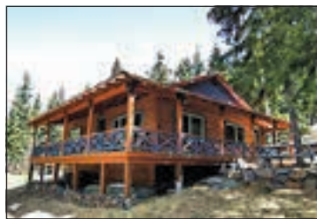
BRIDGE LAKE WATERFRONT LOG HOME W/GUEST HOUSE

Heritage log home on nearly one acre of waterfront. Beautifully & expertly restored w/ no expense spared, everything is new from floors to ceilings including windows, custom kitchen c/w high-end appliances, bathroom & new wood-stove. The 400 sq ft of covered deck is perfect for watching the spectacular Cariboo sunsets. There is a large shop, guest house that sleeps 9 & a dock large enough to tie up three boats. Bridge Lake is renowned for its crystal clear waters, a four season paradise where you can enjoy boating, swimming, fishing & hunting, trail riding, snowmobiling, skating on the frozen lake or just relaxing on the deck. The property is private & secluded yet only 5 min. from Highway 24 (The Fishing Highway). Bridge Lake. Robert Young