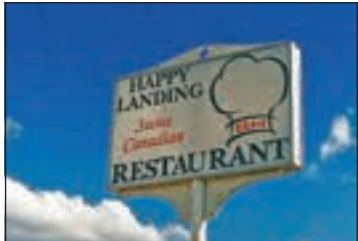
FAMILY RESTAURANT – LAND, BUILDING AND BUSINESS

Established restaurant in family friendly 100 Mile House, BC offering European & Canadian food plus catering services for up to 100 people. The same owners since 1995 "Happy Landing Restaurant" has a great Hwy 97 exposure, the large level lot has ample parking & is potentially sub-dividable. Walking distance from this 90 seat licensed restaurant to several motels & other amenities. Many local, loyal clients & the chosen restaurant for the Rotary Club for 15 years. Very functional layout & ready to go to a new entrepreneur as everything, land, building & business is included in this offering. Definitely worth a look!