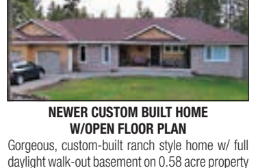
NEWER CUSTOM BUILT HOME W/OPEN FLOOR PLAN

Gorgeous, custom-built ranch style home w/ full daylight walk-out basement on 0.58 acre property in the 108 Mile Ranch area, close to the shopping mall. This is a beautiful open-concept plan which has a fabulous gourmet kitchen, custom cabinetry, stainless appliances, stunning engineered hardwood flooring, vaulted ceiling, great room w/ gas fireplace, closed-in 19x12 sunroom to enjoy the summer evenings, master on the main w/ lovely 5 pc ensuite & walk-in closet decked out w/ custom organizers. The laundry/mud room is a showpiece by itself w/ custom built-in shelving & cabinetry. The basement boasts a huge family room, 2 bdrms, plus a large den or 4th bdrm. 19x12 work-shop w/ plenty of room to expand.