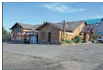
BUSINESS & LAND W/ LIVING QUARTERS – HIGHWAY EXPOSURE

Well established restaurant in the 100 Mile House area. Approx. 80 seats inside plus 780 sq ft patio and attached 4 bedroom, 2 bath living quarters in 5,000 plus square feet building. Operating since 2002 with German and Mexican food being served. Fully licensed. Great opportunity! Additional commercial uses under the present zoning are, hotel, motel, convenience store, liquor store, neighbourhood public house, vehicle fuel station, sales and service of vehicles, farm vehicle and equipment sales, just to mention a few.