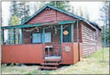
AFFORDABLE RECREATION CABIN

70 Mile House. Dawn Layden/Barb Monical $90,000 MLS# N235677