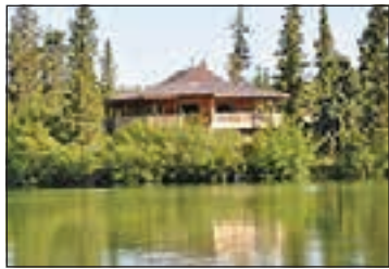
BEAUTIFUL HOME ON BIG BAR LAKE

Priced at Assessed Value! Beautiful 3 bdrm, 3 bathroom home sitting on 1.99 acres & approx. 360 ft of Big Bar Lake Waterfront. Southern exp. w/ 270 degree views of the lake & mountains beyond. Custom kitchen, great room featuring wood burning airtight & distressed oak flooring, vaulted ceilings & large windows to take in your view. Wrap around covered deck on 3 sides provides comfortable outside space w/ access from the great room & master bedroom. Located next to the Historic Big Bar Ranch for added privacy. More info & photo's at www.louiseclerley.com. Big Bar Lake. Louise Cleverley