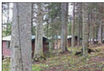
RESORT JUST MINUTES FROM KAMLOOPS – FREEHOLD

Short drive from Kamloops and only 40 km from the Paul Lake Road and Hwy 5 turnoff takes you to this great little fishing lake and the only resort on it. Located on 4.2 ac at 4,100' elev. with 678' of frontage. Hyas Lake Resort comes with 5 cabins, camp sites, 5 boats each with electric motors and batteries. Cabins accom. 4 persons and has its own spotless outhouse, kitchen, living room area with adjoining sleeping area which has either 2 double beds or bunk beds, air-tight stove, cooking facilities, couch, table and chairs. Kamloops. Robert Young