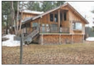
PARK LIKE WATERFRONT ON RUTH LAKE

A rare find! 2.7 acres of waterfront on beautiful Ruth Lake. Park like setting with lots of privacy and level beach area. Comes with a custom built 2500 sq ft 1 1/2 storey home. 4 bdrm, 4 bath & sauna. 2 on the main and 2 above. An abundance of windows to take in the views over the lake. Attached double garage.