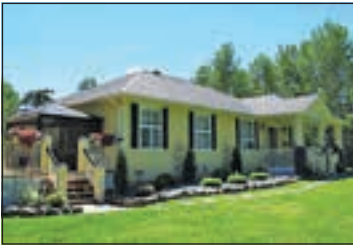
EXECUTIVE HOME NEAR HORSE LAKE

Custom built rancher with full walk-out basement on 12 private acres. This home has it all with top quality finishing throughout. 3 bdrms, 3 baths incl. a deluxe 6 piece ensuite, gourmet country kitchen with granite counter tops, living room features a Kettle Valley Granite F/P & Master Suite with F/P. Lower level you have a media room, exercise room, 2 spacious bdrms & 4 piece bath. Far too many special features to mention here, for more info and Virtual Tour go to www.louisecleverley.com.