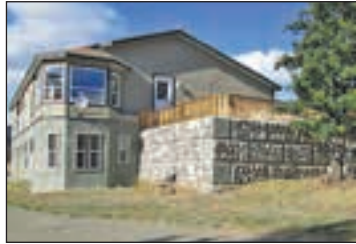
TOTAL PACKAGE - ACREAGE, LARGE HOME AND 2 GIANT SHOPS!!

Lovely modular home situated on 118 acres of rolling hills and trees w/ panoramic view of the Clinton Valley and Limestone Mountains from your covered porch. This top of the line home has 2 bdrms up plus 3 bdrms down to accommodate a growing family or use the basement for an in-law suite. Well tests at 50 gall. per min. Two 2300 sq ft shops with concrete floors plus a small barn are just a few of the many features of this special acreage which borders Crown Land at the back. Many ATV trails and several nice building sites on the property which is not in the ALR. Property would be perfect for large family w/ a trucking business or the shops could be made into barns for an equine setup.