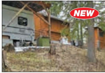
SHERIDAN LAKE WATERFRONT – DOUBLE LOT, CABIN, FRAMED RV COVER & MORE!

Two waterfront lots, now consolidated to one large lot w/ sleeping cabin, framed RV cover, drilled well, electrical power, outhouse & Bell Express-View available. Nice gradual slope to grassy level lakefront of the west end channel off Nath Rd. Quiet cul-de-sac w/ wildlife & birding opportunities for those nature lovers. Quick access to wide open Sheridan Lake for fishing & exploring the pleasurable waters of the lake. Pebble beach access just a couple of blocks away for swimming & all water sports. Nice building lot on elevated hillside for future plans. Extensive multi-purpose trail system close by for ATVs, snowmobiles, dirt bikes, peddle bikes & leisurely walks. Make this your base camp for friends & family!