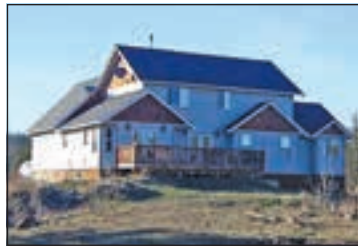
LARGE FAMILY HOME ON SUBSTANTIAL ACREAGE – BRING YOUR HORSES

Perfect large family home or good place for B&B Bale. 120 acres just off Hwy 97 at 83 Mile w/ 83 Mile Creek meandering through the property. Engineered bridge over creek into home site. Paddocks & pasture for your horses & only 20 min. to 100 Mile House for all services. New home w/ warranty in place but no GST. Lots of room for the kids to loose themselves but all fenced so they can't get lost! Crown land backs onto property w/ access to an elaborate trail system for your ATV's or sleds in winter. Only a 5 min. drive to Green Lake and its sandy beaches for great swimming.