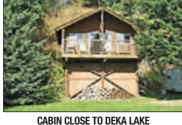
CABIN CLOSE TO DEKA LAKE

Deka Lake. Louise Cleverley $49,000 MLS# N237704