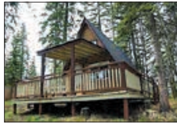
GET-AWAY CABIN IN DEKA LAKE

Lac la Hache, Pat Ford $75,000 MLS# N233256