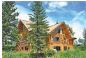
HENLEY LAKE WATERFRONT

Great value for this perfect "ready to go" guest ranch set up! Majestic quality log lodge, separate 4-bdrm duplex, 6-bdrm guest house fully equipped plus cute honeymoon log cabin hidden in the woods. Old charm barn with tackroom, 5-bay garage, workshop, riding arena/round pen. Sunny Henley Lake waterfront acreage. Located in the heart of the busy Interlakes tourist region and only minutes off Highway 24. 10 acre commercially zoned property bordering Crown land on 2 sides, giving access to endless trails. An additional 80 acre pasture also available.