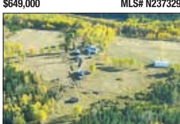
LARGE HIGH END HOME, BARN, PADDOCKS, QUONSET & MORE...

Unlimited potential. Over 7500 sq ft of high end home that would be ideal for a bed & breakfast. Large overall barn with several 8' fenced paddocks for raising horses. Several outbuildings including 40'x60' metal quonset style shop. Old homestead house in restorable condition. Large covered decks and balconies to take in the fabulous sunsets and the snow-capped Marbel Mountains in the West. Tilt-turn fir windows, European high end hot water heating system. Lots of sun exposure with a mix of pasture and forested areas. Crown Land adjacent with endless miles of trails.