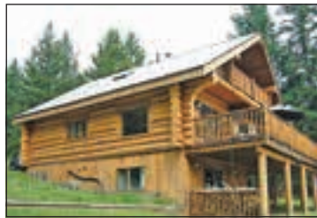
BRIDGE LAKE WATERFRONT HOME W/ 1080 SQ FT GARAGE/SHOP

Beautiful handcrafted log home with over 2500 sq ft of living space and 3.9 acre waterfront property on Bridge Lake's Paradise Bay. The home features an open floor plan with 3 bedrooms, 3 baths, large family room in the basement and a nice sundeck with view on Paradise Bay. There is a 1080 sq ft wired and heated garage/shop with a 540 sq ft attached carport. Nice and quiet setting at the end of no thru road and close to many other nice rec. lakes.