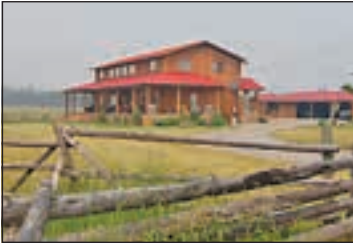
238+ ACRES, LOG HOME, GUEST HOUSE & CARETAKER CABIN & MORE

Secluded Pinecrest Meadows. 238.2 acres of peace & tranquility. Perfect getaway ranch operation, or your main residence. Large main house, guest house, caretaker cabin. Main house, 1894 sq ft on main floor w/ 380 sq ft of enclosed porch. 2nd storey added in 2006 when entire home was renovated. Upper level is open mezzanine style overlooking living & kitchen areas below. Professional kitchen developed basement. Guest house has 864 sq ft on main & 472 sq ft above. Beautiful log home w/ hdwd flrs up & dwn. Main has living room, kitchen, eating area. Upper floor has master & 2nd bdrm. 3 pc bath w/ tub, 4'5 cement floor crawl space.