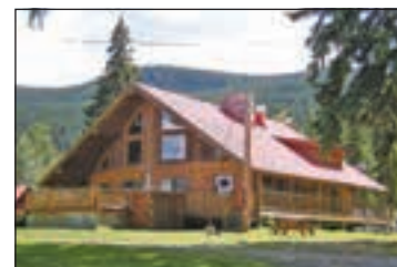
COMMERCIAL CANIM LAKE WATERFRONT ACREAGE, BUILD YOUR DREAM LIFESTYLE HERE!

Beautiful Canim Lake just 30 min. east of 100 Mile House on one of the largest and most desired lakes in the South Cariboo. Being sold as vendors personal residence along w/ all commercial buildings and land. 25 acres on two sides of the road w/ approx. 12 ac on the waterfront. Large log recreational lodge, log cabins, RV sites, hot tub, media rm, playground and numerous outbuildings. Canim Lake is great for fishing, swimming, water sports and of course there is lots of potential for your new and exciting tourism ideas! A four season property. Call today for all details. Also on MLS# N230893.