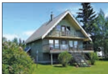
SHERIDAN LAKE WATERFRONT – BONUS - GARAGE/SHOP & BARN

South-facing, level 1-acre Sheridan Lake waterfront home. Recently painted & some updating including new electric furnace. The 2-storey, 4-bedroom country home has a daylight basement, large sundeck off the main level & balcony off the top level. Amazing views & sunshine all day. Great Central Interlakes location within walking distance of Sheridan Lake Store. Manicured, park-like property w/ crystal-clear Sheridan Lake waterfront. Garden area, 3-bay garage/shop, 20'x20' barn. Lots of parking space for RVs. Perfect year-round home or recreational getaway!