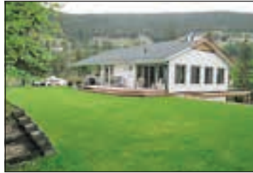
COUNTRY LIVING AT IT'S BEST!

This place has everything you need plus more in country living just 3 miles south of the Village of Clinton. Privately nestled in the trees, this large family home is situated on 11 acres w/ fenced pastures, a large barn plus huge industrial sized shop complete w/ hydraulic hoists, heated, plumbed & room for a suite if needed. The home has been newly renovated & updated with 3 living rooms, large country style kitchen, 2 wood fireplaces, central vac & a fully developed basement. Home & shop both heated w/ hot water from a boiler system which also heats hot water tanks. Domestic Water License on Spring gives you great water plus 2 shallow wells for irrigating use.