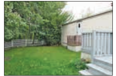
FURNISHED & MOVE-IN READY!

100 Mile House. Barb Monical $52,000 MLS# N240477