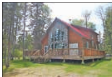
SHERIDAN LAKE WATERFRONT HOME W/GUEST CABIN

One of Sheridan Lakes larger properties of 1 3/4 acres. New home with no GST. Level property with clean beach and a 720 sq ft guest cabin with 2 bedrooms. Impeccably finished with hardwood floors and rock wainscoting. Must be seen to be appreciated.