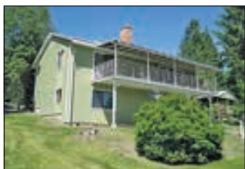
DEKA LAKE – VIEW OF LAKE FROM EVERY ROOM

Two lots, 2 titles, totalling 0.92 of an acre with 115 feet of south-facing waterfront on Deka Lake. Large home w/ fully-finished walkout basement. Two bdrms, 2 bathrooms, 2 wood-burning fireplaces, built-in appliances, open floor plan w/ a fabulous view of the lake from every room. Glass sliders off the living room & master bdrm lead to a 9x33 solarium-style covered deck overlooking the lake. Main floor recently updated w/ new lino, carpet, & paint throughout. Basement is home to a huge rec room w/ bar area, plus another great view of the lake. Exterior was professionally painted (summer of 2012). 24x36 double garage, 12x20 3-sided carport, & woodshed. Paved drwy, nicely tree & landscaped. Access to trails. Deka Lake. Louise Cleverley