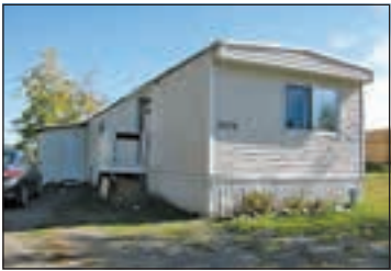
AFFORDABLE UPDATED HOME JUST MIN. FROM TOWN

Why pay for pad rental when you can live here for less. Nicely updated 2 bedroom plus single-wide mobile on a quarter-acre lot with an enclosed porch, sundeck and separate storage shed. Updates include septic and roof (2003), storage shed (2012), flooring and kitchen cabinets, and new hot water tank (2010).