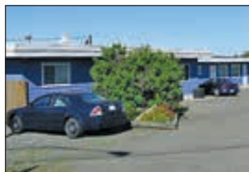
WATERFRONT, DIRECT HWY EXPOSURE – MOTEL W/RV SITES

Waterfront 11 unit motel with 4 RV sites located in the town of Lac la Hache. Motel had a new roof in 2007. Residence had a new roof in approximately 2005. New doors and windows in 2000. This is a perfect family run business with 3 bedroom living quarters. Heated with natural gas water boiler. Picnic tables, fire pits and a one piece dock near the water's edge. Lac la Hache is a very popular year-round recreation lake. Located on Highway 97 for great exposure. Must have an appointment with a realtor to view.