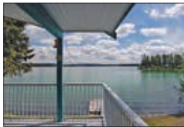
5 BDRM WATERFRONT HOME W/3 BDRM COTTAGE

Bridge Lake. Martin Scherrer/Klaus Vogel $639,000 MLS# N235068