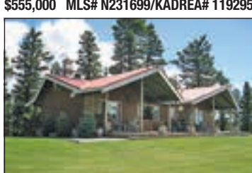
108 ACREAGE W/TWO HOMES & VIEWS

Two homes, two titles of 10.03 acres w/south-west exp. & 180 degree view of 2 lakes & valley. Main home of 1,600 sq. ft. on 2.97 acres & is meticulously maintained w/3 bdrms 2 bathrooms, family rm, open post & beam floor plan for the kitchen, eating area & living rm with a view & a unique floor to ceiling split rock f/p. Large wrap around deck to enjoy your property & the view. 2nd home of 1,100 sq. ft. w/2 bdrms & 1 bath on 7.07 acres is an excellent mortgage helper. Large shop for all the toys & plenty of room for a horse or 2 w/fencing. Privacy 10 min. to 100 Mile House.