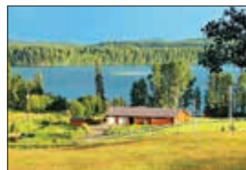
BRIDGE LAKE LOG RANCHER W/GUEST CABIN

Looking for perfection? Check out this immaculate Bridge Lake waterfront log home rancher. All on one convenient level with attached double car garage and separate guest cabin/workshop. Approx. 1500 sq ft, 2 bdrm, 2 bath, vaulted ceiling in the living room with rock fireplace. Nicely manicured 2.2 acres south facing level parcel with crystal clear 220' waterfront. Established garden. Absolute pleasure to show!