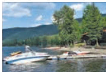
CANIM LAKE WATERFRONT RESORT/CAMPGROUND

South Cariboo's most attractive resort/campground! Awesome 7.4 ac waterfront property on majestic Canim Lake. Top quality buildings and infrastructure including spacious full bsmt log home with office, several self-contained cabins and a modern 8-plex condominium. Approximately 30 RV sites along the 650 feet of sandy shoreline and amongst big fir trees. Barn and pasture for potential horseback riding option. Room to expand. Truly a great opportunity for an enthusiastic entrepreneur. Same owner for over 30 years!