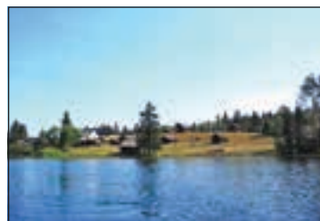
GUEST RANCH - OPPORTUNITIES GALORE

Double T Guest Ranch. This historic ranch offers 143 ac of deeded land, a 5 bdrm home, 12 rustic cabins which can accommodate 70+ guests, numerous outbuildings and a beautiful setting with pristine waterfront on Burns Lake. The ranch is located amidst great fishing and hunting country and borders Crown land as well as another small lake. A range permit and grazing lease are also available. Lots of opportunities with this ranch, like family business, company retreat or group investment. Nearby 160 ac parcel with 100 ac in hay also available combined with the ranch.