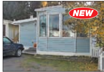
WALK TO EVERYTHING!