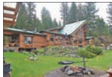
EXECUTIVE FAWN LAKE WATERFRONT HOME W/GUEST CABIN

This is what you move to the South Cariboo for - perfect retirement. West Coast style rancher w/ 10 acre facing south on Fawn Lake. Noted rainbow fishing w/ electric motor restriction for rest & relaxation. Year round fully serviced guest cabin so even your company gives you peace & quiet. Heated shop & storage for the toys. Majestic fir forest to drive through on your way down to the lake. Fully landscaped w/ waterfall pond & flowering gardens. Covered picnic area at lakeside for barbeques year round (ice fishing right off the deck). Seasonal creek will see the spawning trout right in your front yard. Fawn Lake. Brad Potter