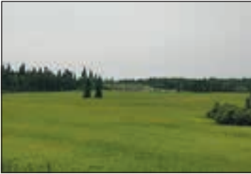
ACREAGE, GRAVEL PIT, SHOP ETC.

Lots of potential on this 160 acres of hay fields, meadows, large gravel pit, old growth fir and graveled trails galore. Easy access of paved Fishing Hwy 24 with distant views of Sheridan Lake. Open the gate at back of property on to Crown Land and hit the expansive trail system to visit neighbouring lakes and forests. Large 3 year old shop with 14x16 ft. doors on each end, & 10x10 ft. mezzanine. Owner currently has shop set up as living quarters with washroom, kitchen, bedrooms etc. There are also two 12x16 newer storage sheds on the property and an unfinished 14x16 guest cabin c/w loft set off in the woods. Bring your ideas. Owner states property is subdividable. Sheridan Lake. Robert Young