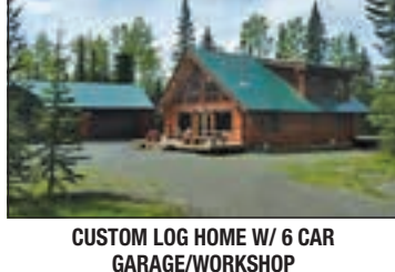
CUSTOM LOG HOME W/ 6 CAR GARAGE/WORKSHOP

Cariboo perfection! Immaculate, custom built 2 bdrm/2 bath log home w/ matching huge 1,800 sq ft log 6 car garage/workshop all on park like, horse acreage in the central Interlakes recreational area. Starting with a great log arch entrance gate, entering this manicured 5 acres property, close to popular Fawn Lake will impress even the most discriminating buyer. The 4 year old log home is finished to perfection, bright, open design, quality country kitchen, wide plank wood flooring. Big front & back sundecks taking advantage of sunrise and sunsets. Fenced dog kennel & lot of RV parking space for guests. Ultimate workshop for the handyman. Property would also be suitable for horses w/access to Crown Land trails & fishing.