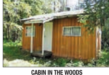
CABIN IN THE WOODS

Deka Lake. Brad Potter $59,000 MLS# N234771