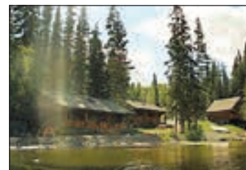
LAC DES ROCHEES RESORT

Full service year-round resort/restaurant on approx. 38 ac on one of the most photographed lakes in BC along "The Fishing Highway." Only 5.5 hrs from Vancouver and just 1.5 hrs north of Kamloops. 12 modern units. Fantastic views from the fully licensed dining room and 3 level deck at the log lodge. Paved to driveway, access by car or float plane. Property backs onto Crown land. Room for expansion, only a few of the 38 acres developed. Mayfly hatch. View virtual tour - www.fishbob.ca