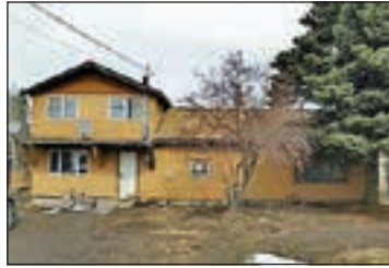
FIXER UPPER AT A GREAT PRICE!