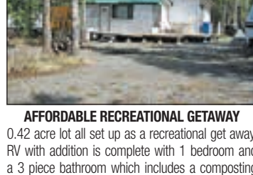
AFFORDABLE RECREATIONAL GETAWAY

Deka Lake. Brad Potter $65,000 MLS# N237485