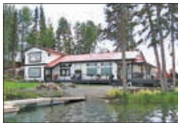
PRISTINE SHERIDAN LAKE WATERFRONT

Beautiful and spacious Sheridan Lake w/f home. This 3 bdrm plus office, 2 bathroom home has been totally renovated incl. a large addition in the last few years. Open floor plan concept w/massive windows to take in your views from all main living areas. Master bdrm on main w/french door to sundeck and large ensuite featuring a clawfoot tub and walk-in tiled shower w/massage jets. Upper area w/large rec room featuring a propane f/p, exercise and bar area. Great sundeck, landscaped prop., 30x30 garage, 24x24 carport, greenhouse and 0.75 acre w/221 ft. of frontage completes this excellent package on the lake. Located next to an undeveloped access for added privacy.