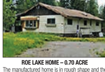
ROE LAKE HOME - 0.70 ACRE

Lac La Hache. Pat Ford $65,500 MLS# N240596