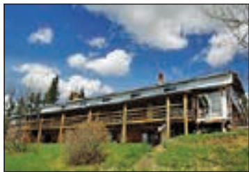
12 BDRM HOME, SUBSTANTIAL ACREAGE – ENDLESS POSSIBILITIES!!

160 acre B&B/hobby farm with 12 bedrooms. Nice set-up adjoining Crown land w/ numerous trails. 120 acre grazing lease available. Nice mix of hay fields, pasture & treed areas. 2 barns, storage sheds & shop. Fenced & cross-fenced. Ready to go for winter & summer activities. Fantastic southerly views & close to Watch Lake and Green Lake. Great opportunity to own this large home & beautiful property at a reasonable price. Another special feature of this property is a scenic wildlife & canoeing lake. Bring your ideas to this unique property.