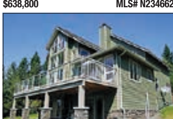
QUALITY HOME W/VIEWS OF BRIDGE LAKE, 11+ ACRES

WOW! The quality of this Jenish planned home is incomparable. Built to last with too many features to list here. The elevated home site offers distant views of Bridge Lake from the 11+ acres. State of the art fireplace heating system, pellet stove, cathedral ceilings, expansive south-facing windows, tile & birch flooring, 3 bath, stainless steel high end appliances, propane cooking, Bosch high-efficient hot water system, totally zoned plumbing, 3 bay 220 amp wired garage/workshop, garden shed c/w Dutch door & did I mention the extremely cute cabin in the woods for your guests! Fenced garden area, landscaped yard, heavily treed 'backyard' c/w interesting trail system. Easy access to fishing just down the road. Guest cabin in the woods.