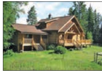
WATERFRONT ACREAGE ON BRIDGE LAKE

Log home on 2.6 acres with 334 ft. of frontage on Pristine Bridge Lake. This lovely home has 3 bdrms, 3 baths, 2 wood burning fi replaces, built-in surround sound system, wine cellar, sauna & the list goes on. Great view of the lake from all main living area's as well as the solarium off of the dining room & the master bdrm with its own balcony. Currently operating as a B & B with the self-contained suite in the walk-out basement. Large garage, green house, fenced garden area, fenced paddock & a very private property with SE exp. for all day sun.