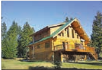
SPACIOUS LOG HOME W/ 40X30 SHOP

Beautiful log home close to Sheridan Lake & all amenities at Interlakes Corner. Nice view over a hay field, Sheridan Lake & hills beyond. The home features 3 bdrms & over 3000 sq ft of quality living space. Huge master bdrm upstairs w/ 4 pc ensuite & Jacuzzi tub. Nice open floor plan on the main w/ large country kitchen (all stainless steel appliances) & cozy living room w/ a pellet stove. Outbuildings include a 26 x 31 garage & a 40 x 30 shop. Both are insulated, heated & wired w/ 220V. Large carport attached to the shop under which to park your 40' RV. All this on 2.03 manicured acres.