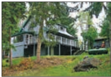
BRIDGE LAKE HOME ON ACREAGE W/ 60' X 36' SHOP

Nicely updated year-round home or recreational get away on beautiful Bridge Lake. Over 1900 sq ft of living space with 3 bedrooms, open floor plan with nice sun room to enjoy the view over the lake. 6.3 acres of park-like property with over 300 feet of waterfront situated in a nice bay. Outbuildings include a 60x36 heated shop with 220 wiring and attached storage shed, separate storage/wood shed, garden shed and carport. Nice setting within walking distance to Bridge Lake store and school.