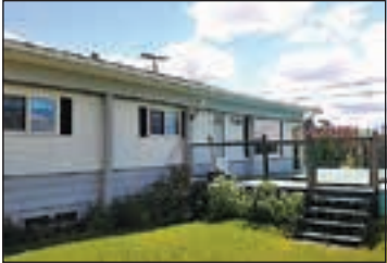
A SUMMER & WINTER HAVEN!

103 Mile House. Debbie Popadinac $93,500 MLS# N239824