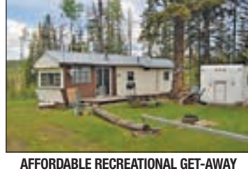
AFFORDABLE RECREATIONAL GET-AWAY