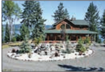
STUNNING 6 BDRM HOME W/ 180° VIEW OF BRIDGE LAKE

Beautiful timber frame home w/ over 3400 sq. ft. & 6 bdrms, 4 bathrooms, games room & a stunning great-room w/ a 22' vaulted pine ceiling. The floor to ceiling windows offers a 180 degree view of Bridge Lake & the surrounding mountains & ranch land. There are massive fir beams, fir & maple cabinetry, fir flooring & solid fir doors. Large, partially covered wrap around deck w/ gas BBQ hook-up. The amazing landscaping features a winding creek w/ waterfall & several trees & xeriscaping plants, all built within a circular driveway. Add to this, a detached 2-car garage, a 40x60 sq ft workshop w/ 1600 sq ft loft & large pump house. All this on 14.87 private acres w/ subdivision potential.