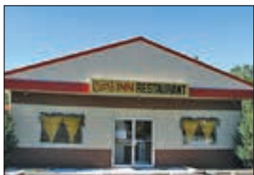
HOME W/ BUSINESS POTENTIAL – HWY 97 EXPOSURE

Nice 3 bedroom, 5 bath family home in Lac la Hache with over 3400 sq ft of living space. Nice location amidst great fishing and hunting country and skiing area close by. Lots of potential with this place. Zoning allows for home based business with great Hwy 97 exposure.