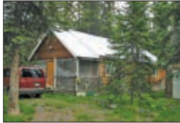
COTTAGE NEAR DEKA LAKE

Clinton. Dawn Layden $22,500 MLS# N239401/KADREA# 124662