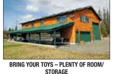
BRING YOUR TOYS - PLENTY OF ROOM/STORAGE

1st time on the market for this immaculate home. The unique design incorporates huge drive-thru main floor with 2 - 14' ft. garage doors & 2 - 8' garage doors. You could pull a logging truck right in & still have room for a few cars. You live upstairs in the well-designed 2 bdrm accommodation. Large park like 1.28 acres w/ 8.6'x17' greenhouse, wired gazebo, storage shed, 4 bay detached carport/garage. 13'x60' attached carport. Wood airtight on main level & pellet stove upstairs help keep heating costs low. High producing well & much more. All this & only a block from launching your boat in the waters of Deka Lake or hitting the vast trails with your quad or snowmobile. Deka Lake. Robert Young