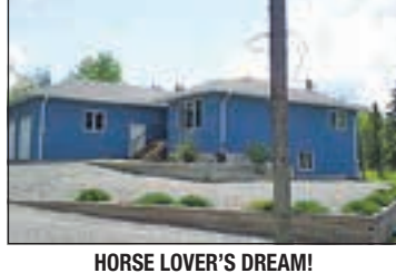
HORSE LOVER'S DREAM!

Beautiful, well-built family home on 15.99 park-like acres. The home features 3240 sq ft of living space w/ 6 bdrms & an open floor plan w/ spacious living & dining area & a large, custom oak kitchen w/ an island. There is a 642 sq ft double garage attached to the house & outbuildings consist of a 24x27 horse barn, a 27x21 detached garage/workshop & a 13x65 storage building. The property is fenced & x-fenced for horses, contains a small hay field & the remainder is treed pasture. The property is situated on a quiet road, close to Horse Lake School & only 20 min. away from 100 Mile House.